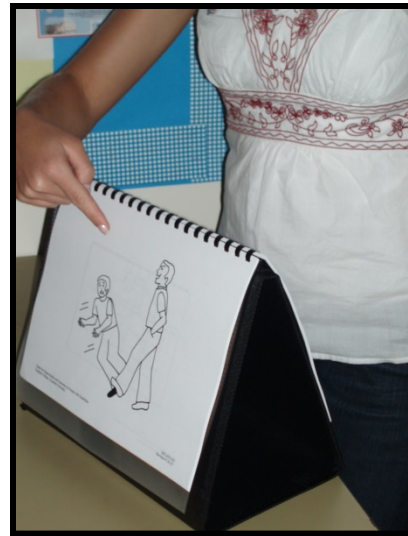
Figure 3 shows the correct positioning of the trainer in relation to the booklet.